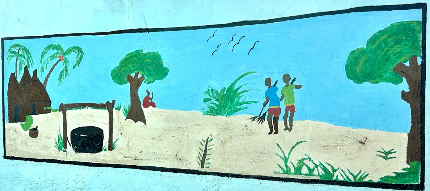
One of the beautiful murals created by volunteers in our center

Maison de la Gare strives for and is committed to the well-being of talibé children of all ages, and to giving them the opportunity to lead healthy, productive lives.