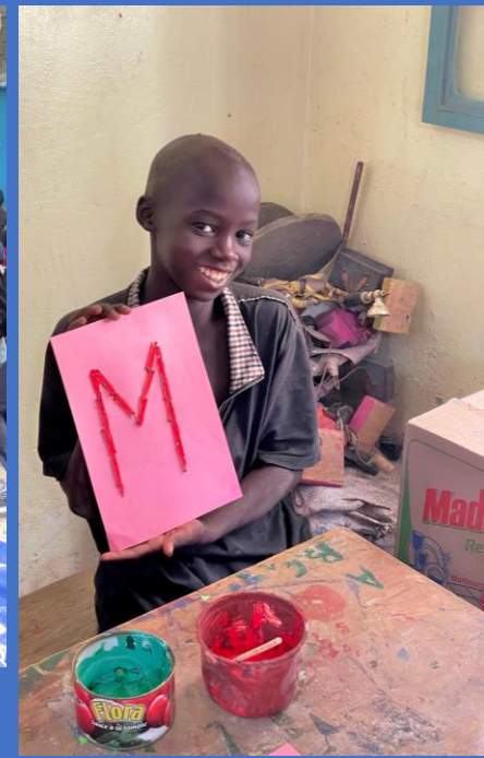
Enthralled in an art class