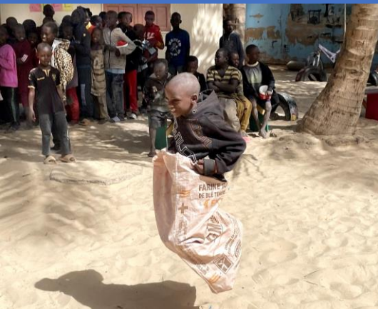
A chance to play as children