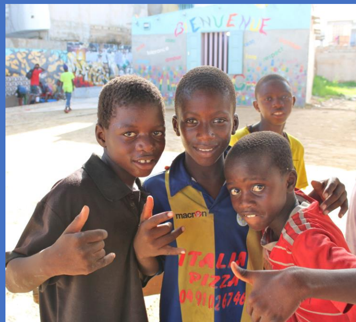
Happy to be safe and cared for