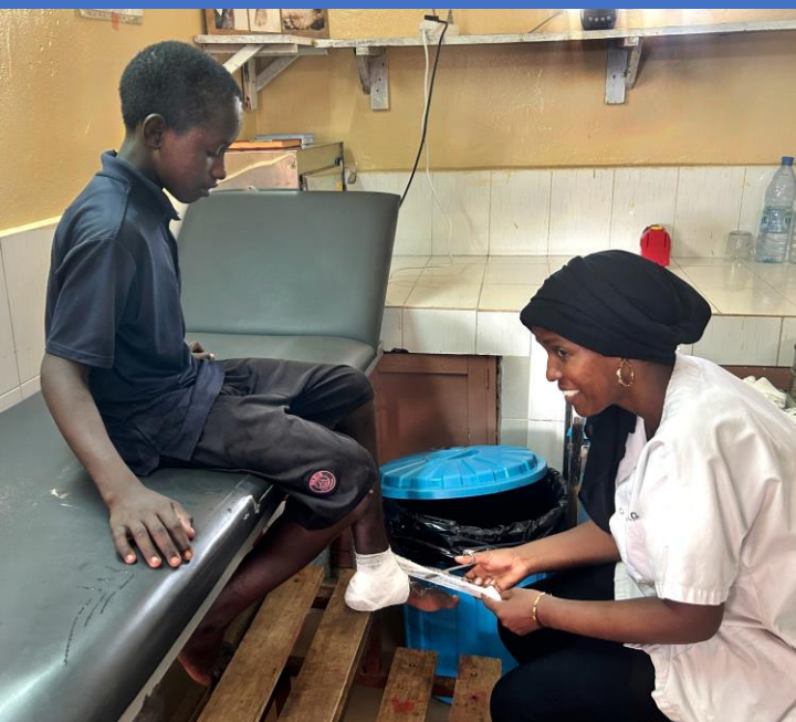
Cared for in our infirmary