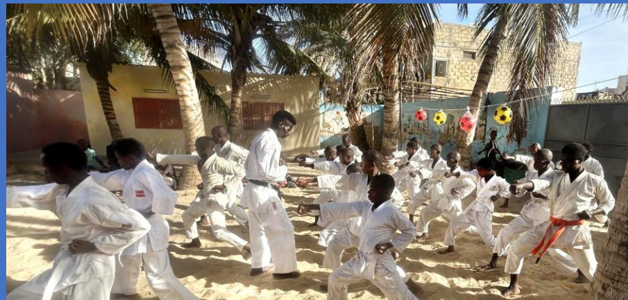
Morning karate class in the center