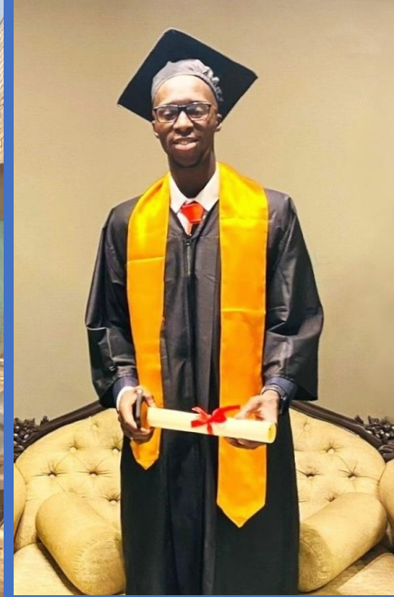
Proud moment as a talibé becomes a university graduate