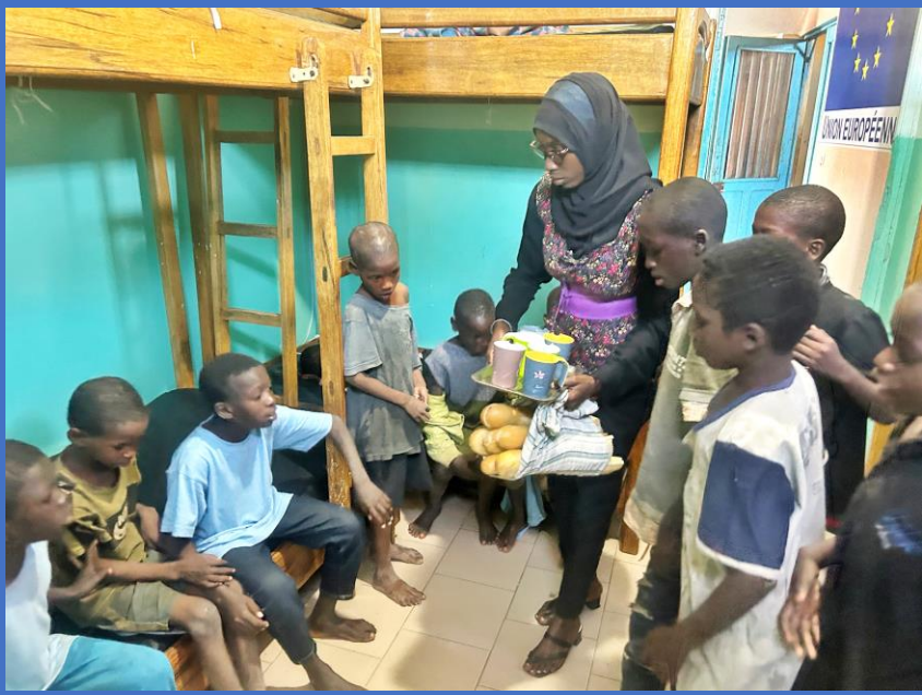
Our overloaded emergency shelter welcomes hundreds of children from the street